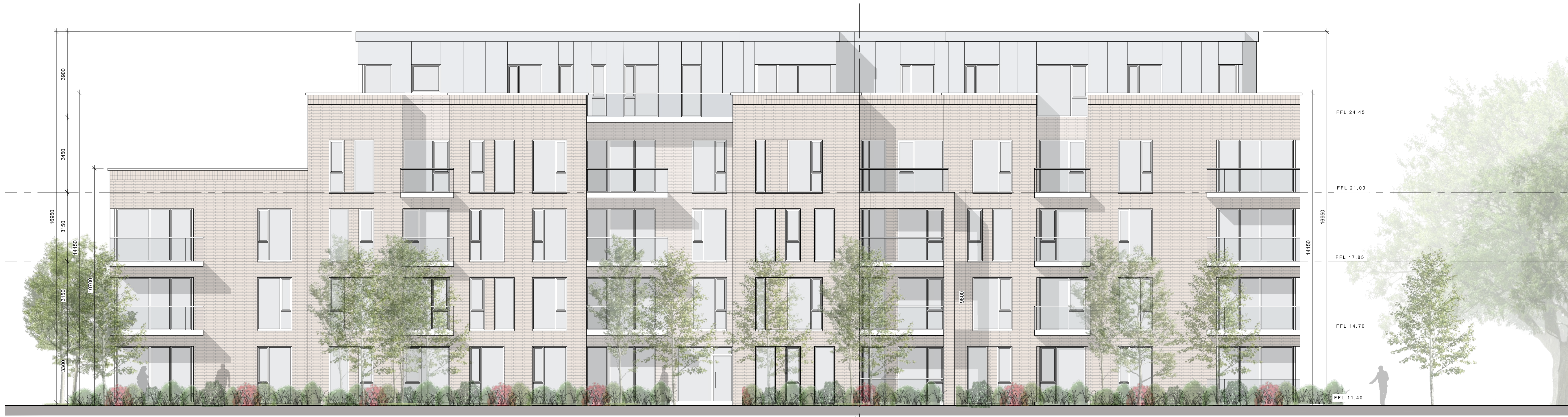
BLOCK 1 WEST FACING ELEVATION SCALE: 1:100